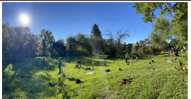
Large-Scale Tree Planting on TUBs Location #1

Background on Regional Frequently-flooded Property Buyouts: The impact of large flood events, such as Hurricane Harvey and other frequent repetitive flood events that impact rivers and waterways both upstream and downstream in respective regional counties, compounded by tropical storms originating in the Gulf of Mexico, sparked substantial increases in buying out FEMA-qualified properties to reduce flood risk but more needed to be done to improve these properties - mainly in high-health risk and EJ communities.