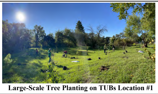
Large-Scale Tree Planting on TUBs Location #1

Background on Regional Frequently-flooded Property Buyouts: The impact of large flood events, such as Hurricane Harvey and other frequent repetitive flood events that impact rivers and waterways both upstream and downstream in respective regional counties, compounded by tropical storms originating in the Gulf of Mexico, sparked substantial increases in buying out FEMA-qualified properties to reduce flood risk but more needed to be done to improve these properties - mainly in high-health risk and EJ communities.