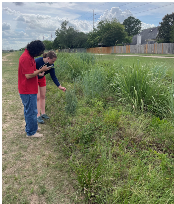
Example: HCFCD demonstration bioswale in Houston

Additionally, the Riverine TUBs Program partners are working together to create Best Management Practices (BMPs) for NBI techniques, especially bioswales, that NRCS and other partners can use to advise application of NBI techniques along other riparian corridors and the Texas coast. NBI enhancements and monitoring activities conducted through the Program will help mitigate flooding, improve water and air quality, restore natural habitats, and benefit at-risk communities.